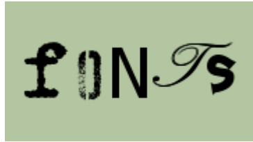
Text Objects String